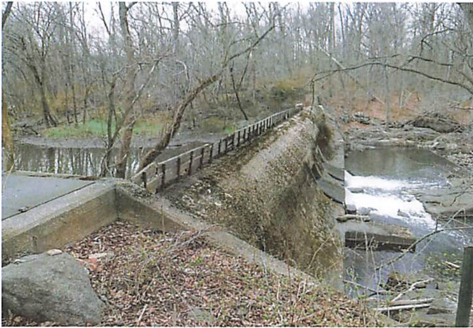
Photo 1 Dam ID# 233-0866 Mamaroneck Reservoir Dam 04/05/2022 Downstream face