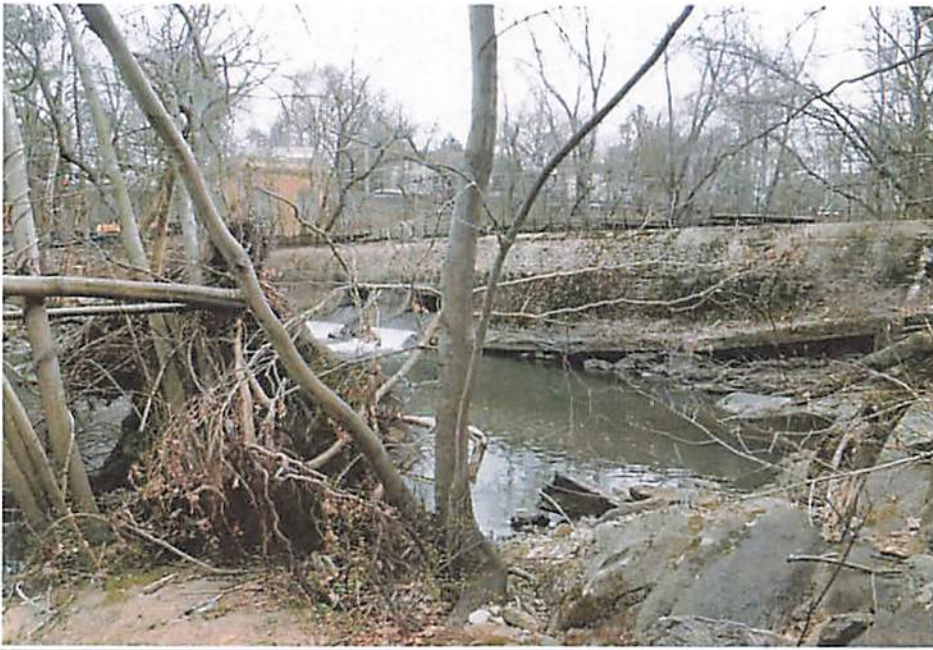
Photo 4 Dam ID# 233-0866 Mamaroneck Reservoir Dam 04/05/2022 Downstream face