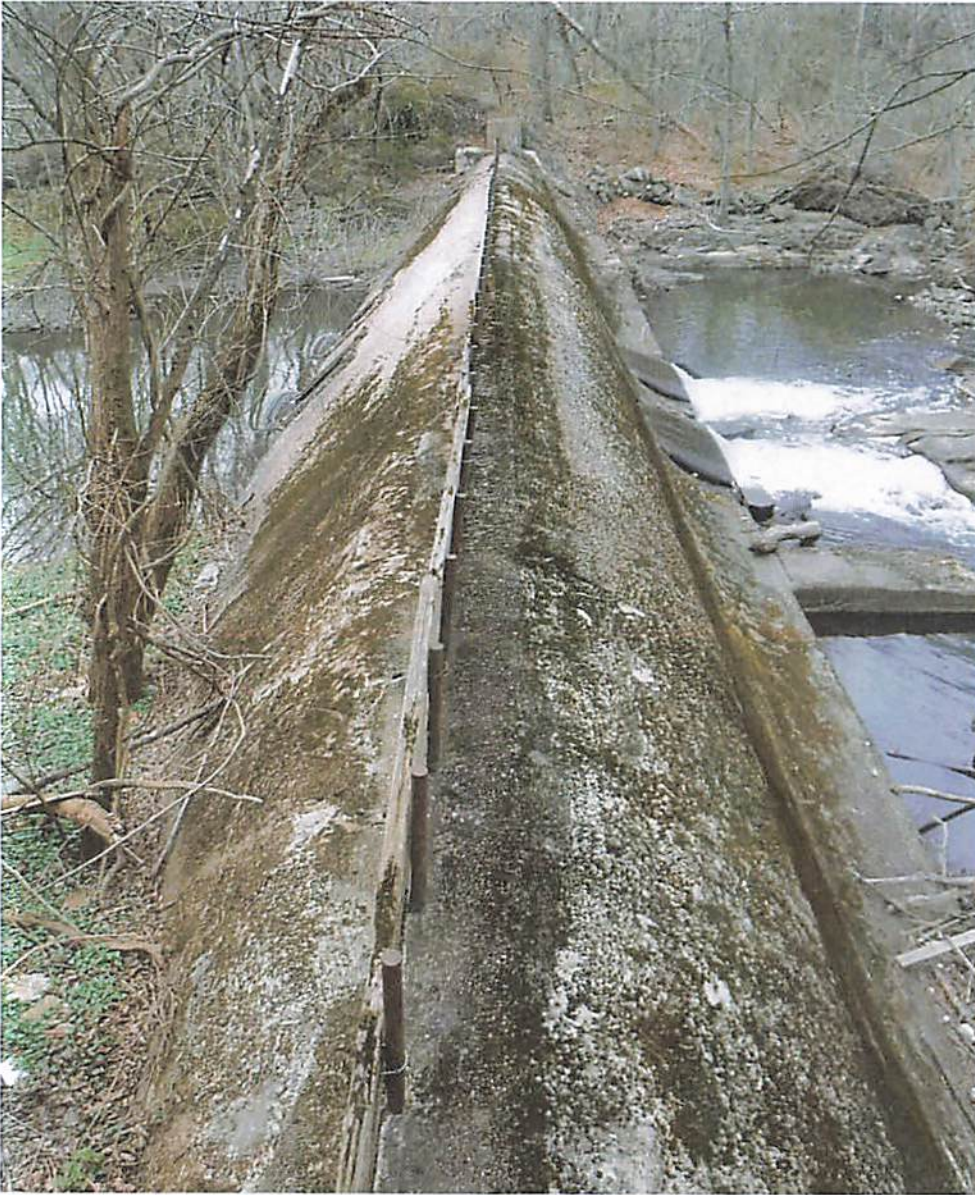
Photo 3 Dam ID# 233-0866 Mamaroneck Reservoir Dam 04/05/2022 Dam crest