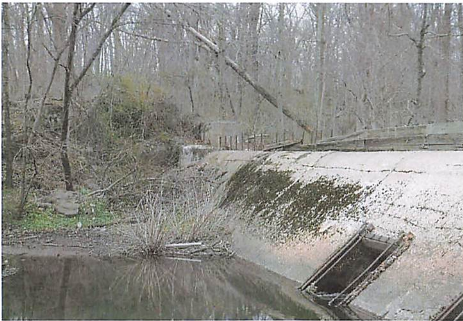
Photo 2 Dam ID# 233-0866 Mamaroneck Reservoir Dam 04/05/2022 Upstream face