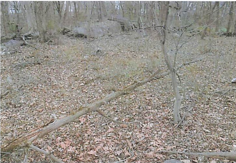
Photo 5 Dam ID# 233-0866 Mamaroneck Reservoir Dam 04/05/2022 Auxiliary spillway